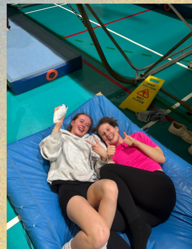
my SUPER fun colours posi