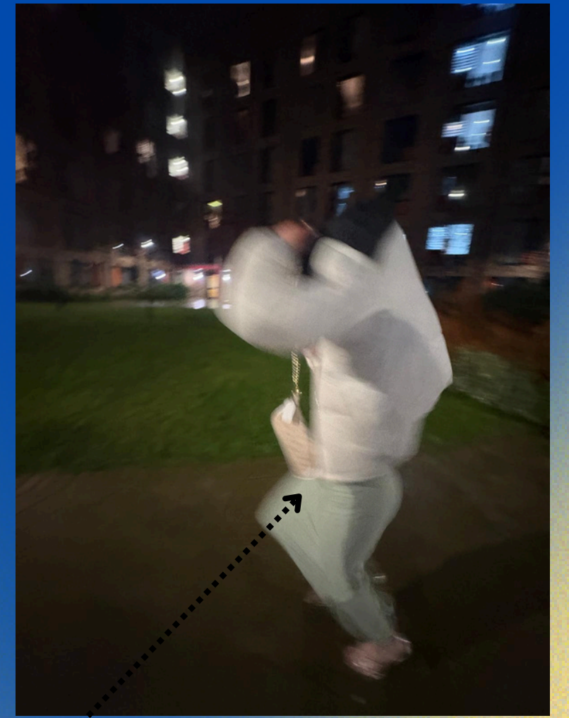
*me running into the new year

Thank you and I can't wait for another super fun year!!!!