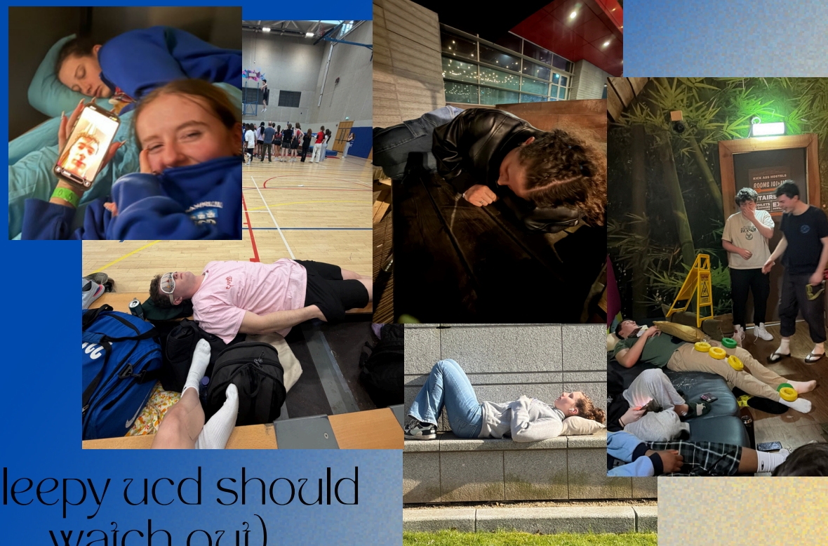
(sleepy ucd should watch out)

I NEVER miss a opportunity for a fantastic photo